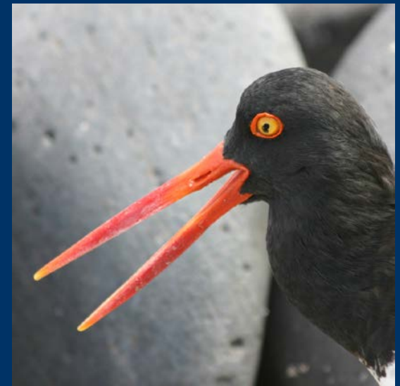
American Oystercatcher