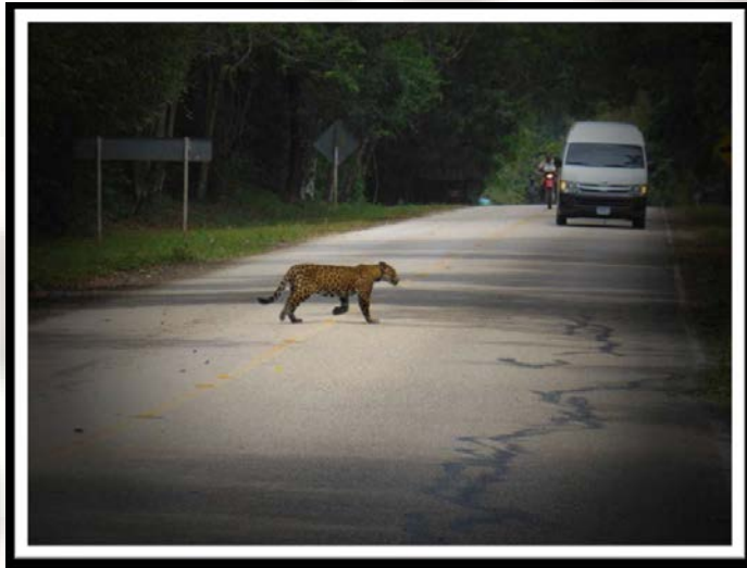
Tikal National Park, Maya Biosphere Reserve, Guatemala