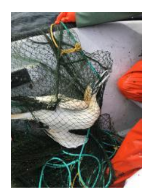
Photo: Northern Gannet caught in control surface-set herring gillnet

study, which compared bycatch rates of nets equipped with visual deterrent high contrast black and white 'warning flags' with unmodified control gillnets, found no difference in fish yield between modified and control nets. This is an important first step in ensuring that the modified gear is feasible for widespread use. Results related to seabird bycatch showed promise; however, because seabird bycatch is highly episodic more testing is needed to assess the extent of benefit provided by the mitigation approach.